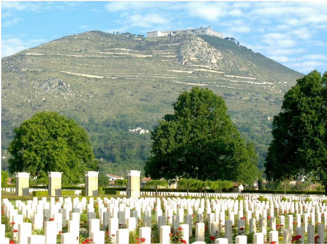
Cassino Cemetery, Italy

Albert's grave is number XIV.B.3 at the CASSINO WAR CEMETERY , Italy