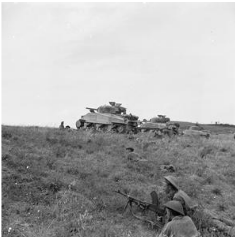
Left: Men of 2/5 th Leicestershire Regiment supported by Sherman tanks in Italy, 1944